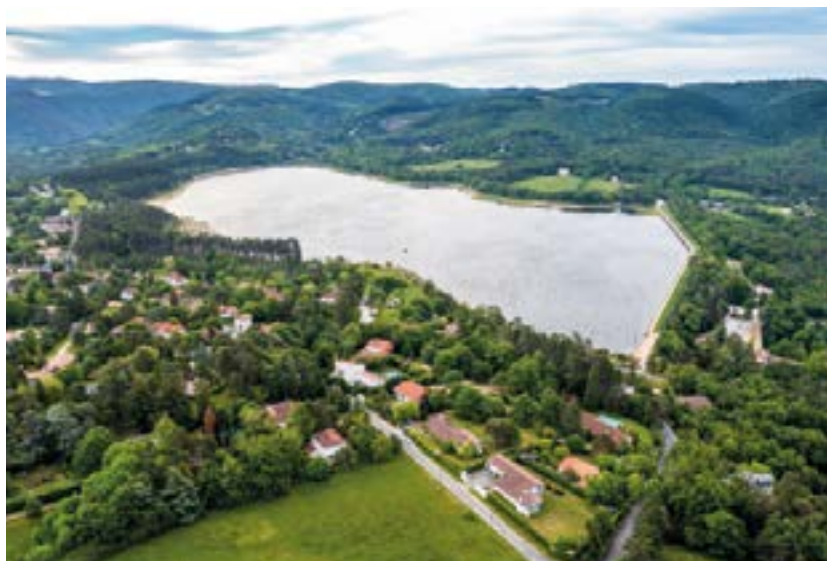
From top: The stunning wooden market hall at Saint-Félix-Lauragais; Saint-Ferréol lake is a charming spot for a walk, bike ride, swimming or orienteering

In today's hectic times, slow tourism – the gentle art of French living combined with the seductive power of nature with a focus on sustainability – really is something to be embraced. If you want off-the-beaten-track escapism and the very best of French hospitality, culture and outdoor pleasures, Pays de Lauragais in the south-eastern tip of Haute-Garonne comes with a five-star recommendation. FT