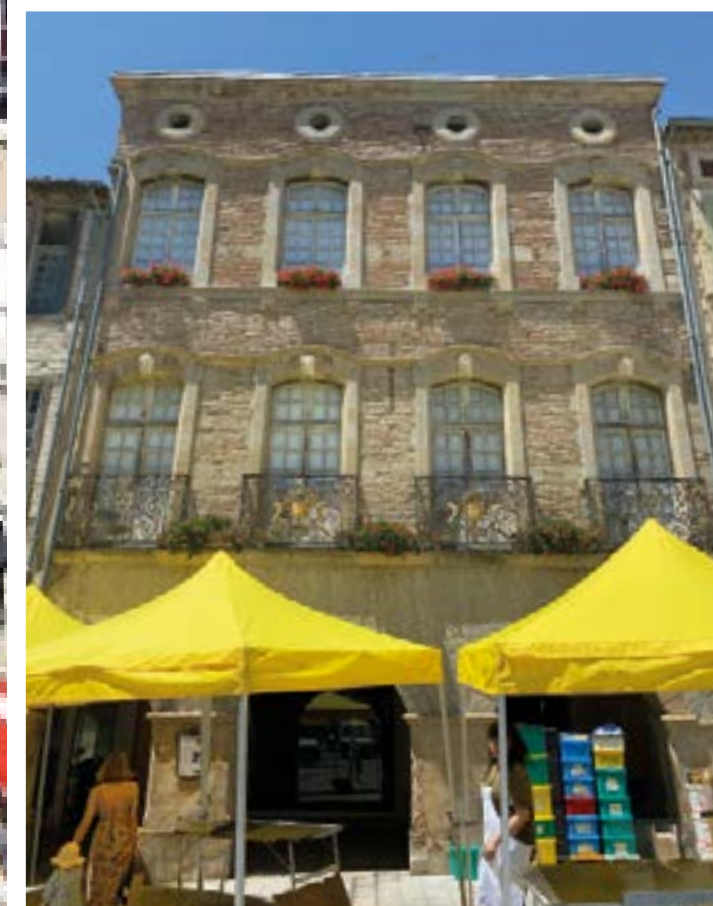
Left and above: The splendid market in the heart of Revel; the town was once home to Pierre-Paul Riquet, mastermind of the Canal du Midi